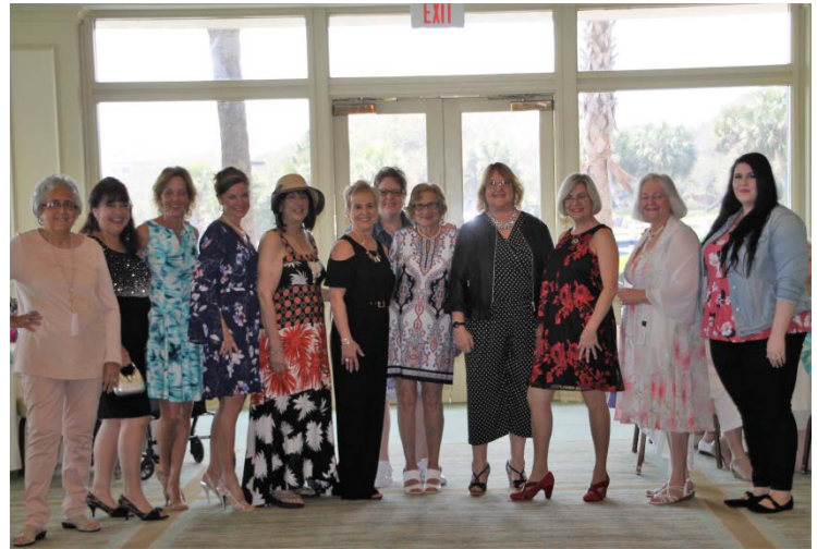
Event Organizers and models from this year’s Fashion Show.

Price: $25.00 per person, includes tax and gratuity